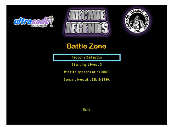
FIGURE 3-3 DIPSWITCH SETTINGS MENU