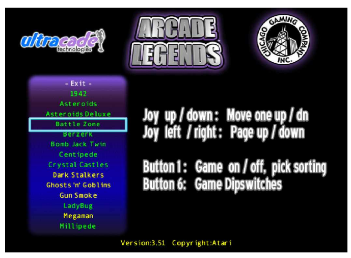
FIGURE 3-2 GAME CONFIGURATION MENU