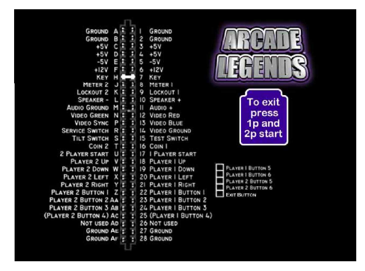
FIGURE 3-6 JAMMA TEST

The JAMMA Test is similar to the Control Test but it is expanded to encompass the entire JAMMA harness and connector. Operate each player control in turn through the JAMMA Test screen and check that it lights up on the screen. This process confirms the proper working order of the test button, coin drop, and wiring features. To exit the JAMMA Test press both player one and player two start buttons or wait fifteen seconds for the test to timeout and exit.