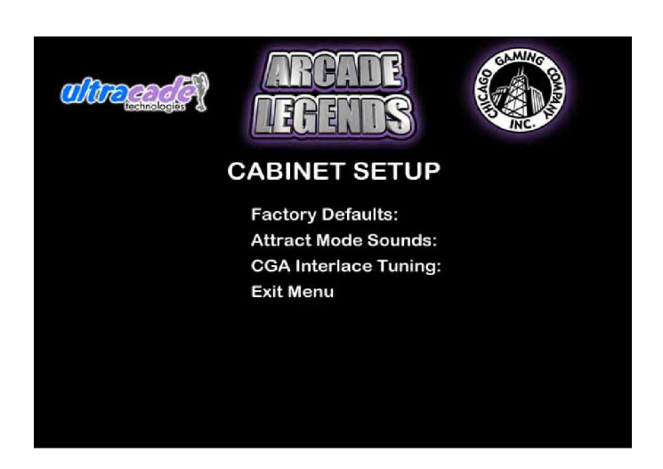
FIGURE 3-9 CABINET SETUP