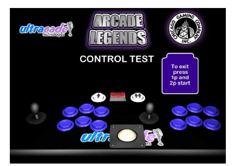
FIGURE 3-5 CONTROL TEST

This test is used to check the functionality of the player controls. Operate each player control in turn. Each button press or joy-stick direction will light when activated. If any controls are not functioning, go to the trouble shooting section. To exit the control test press both player one and player two start buttons. If one or both start buttons are not working the control test screen will automatically timeout in fifteen seconds.