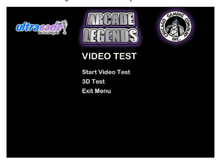
FIGURE 3-8 VIDEO TEST

To advance through the test screens press button one.