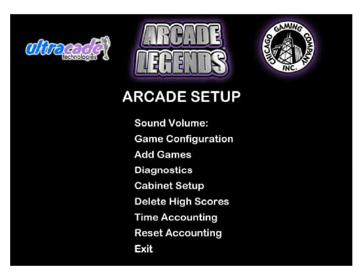
FIGURE 3-1 ARCADE SETUPMENU

To choose a menu option, move the arrow or cursor so that the desired option is highlighted. This is done using the player one joystick. When the desired option is highlighted, press player one button one to select it and enter that submenu.