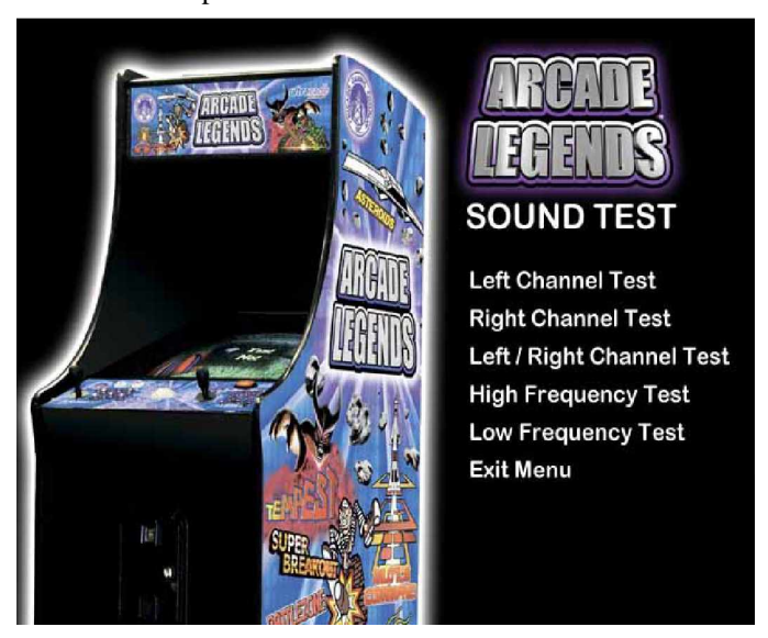
FIGURE 3-7 SOUND TEST