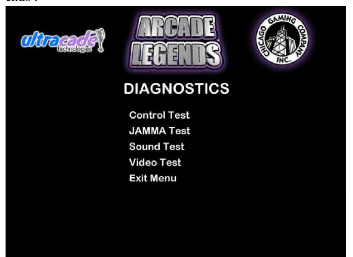
FIGURE 3-4 DIAGNOSTICS SUB-MENU

The diagnostics option will enter you into a sub-menu displaying the different diagnostics you can run on your Arcade Legends .